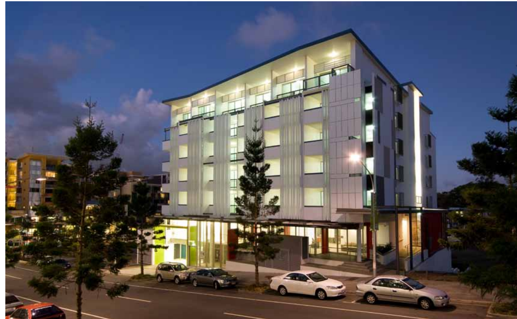
Tom Burns Place, Kelvin Grove Urban Village. A mixed use development comprising 2 commercial tenancies and 56 self contained apartments completed in 2007. Brisbane Housing Company proudly acknowledges the support received from the Queensland Government, Brisbane City Council and our Community Shareholders including Queensland Shelter.